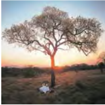
ROYAL MALEWANE ★★★★★ Greater Kruger