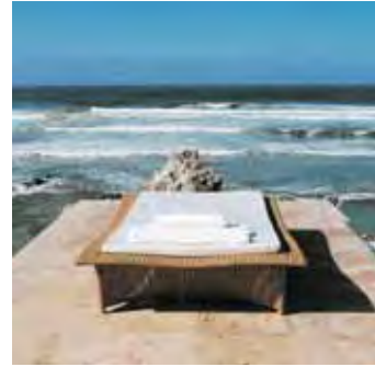
BIRKENHEAD HOUSE ★★★★★ Hermanus