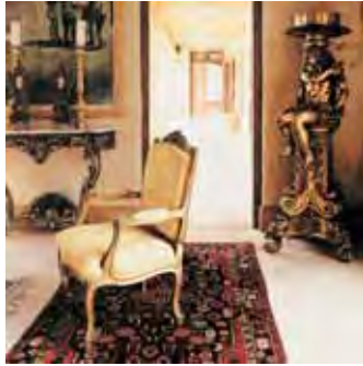
LA RESIDENCE ★★★★★ Franschhoek